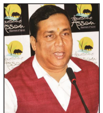
Jayanta Malla Baruah

The Assam government is contemplating a new addition to the state’s tourism map in the form of a mega seasonal tourist spot on the sandbars of the Brahmaputra river sand beach. Jayanta Malla Baruah, Tourism Minister for Assam chaired a review meeting at the proposed site at Brahmaputra Bali Sapor (river sand beach) which would be developed as a seasonal tourist destination by the tourism department. “The destination will host different adventure sports, traditional sports, art and crafts and many new events which will offer a pleasing experience for the visitors,” Baruah said.