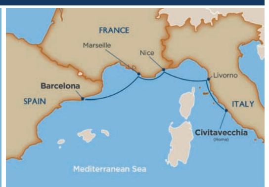
Barcelona to Rome Dep. Dates: Dec 17, 31, 2023 Jan 14, 28; Feb 11, 25; Mar 10, 24, 2024

Witness breathtaking seasonal light shows like the one on the exterior of Sagrada Familia or on the Ponte Vecchio bridge in Florence, see Rome at its holiday best with Christmas trees at St. Peter's Square, the Colosseum and Spanish Steps, and breathe in the enchanting fragrance of roasting chestnuts on the vibrant streets of Barcelona and many more.